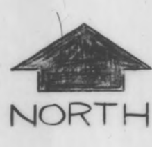
1 MECHANICAL SITE PLAN M1 SCALE: 1" = 30'