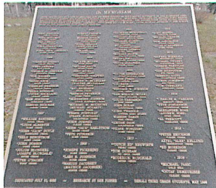
A memorial plaque honors gold miners who died in the area. Many are buried in the cemetery.

That same year, the Clay Street Cemetery Commission was established by the City of Fairbanks to advise on restoring, maintaining and improving the cemetery.