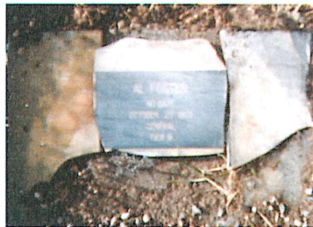
Broken grave marker for Al Foster. Plot: General Tier: NW Quarter, Row: 248

The cemetery was once filled with wooden crosses, monuments and numerous wooden grave fences but time, harsh weather conditions and vandals destroyed most of the wooden grave markers. Further degraded by floods and a lack of maintenance, the cemetery was in poor condition by 1982, when it was listed on the National Register of Historic Places.