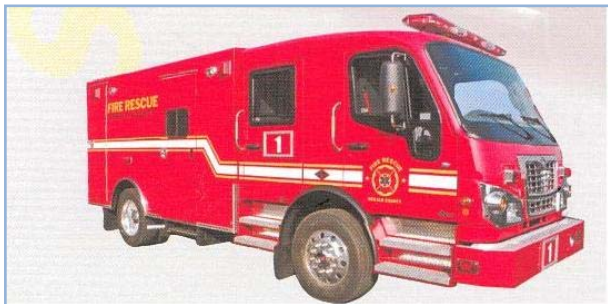
Medium Duty Model Ambulance

We feel that we will be able to extend the service life of our front line ambulance from two to four years with the upgrade from a light duty to a medium duty model. The estimated four year cost of a medium duty ambulance at $260,000 compared to the $320,000 for two light duty ambulances ($160,000 each) will be a $60,000 savings in that four year period.