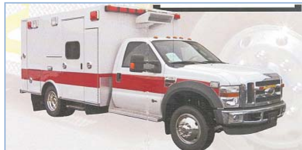
Light Duty Model Ambulance