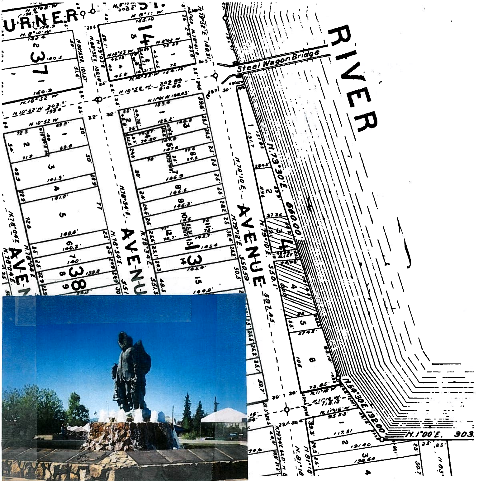
GOLDEN HEART PLAZA LEASE EXHIBIT 1 OF 1